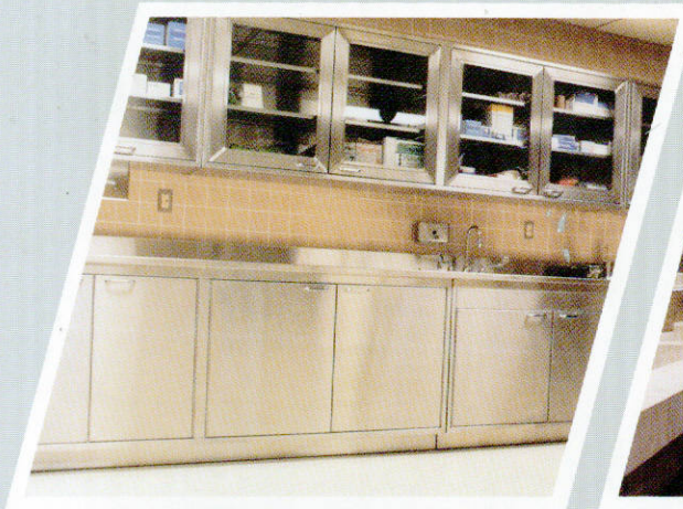
Stainless Steel Hospital Cabinetry