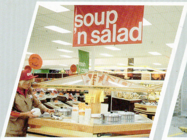
Soup and Salad Bar for the Food Industry