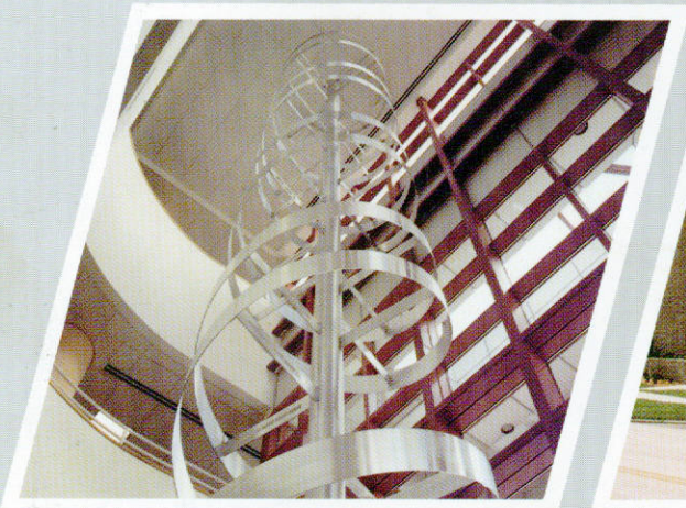
"DNA Double Helix" Aluminum Sculpture