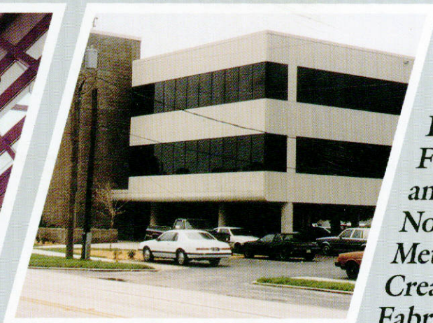
Aluminum Panels for an Office Building

In Ferrous and Non-Ferrous Metals ... Creative Fabrication