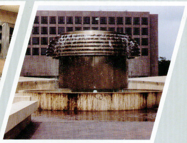
Stainless Steel Water Fountain at a Convention Center